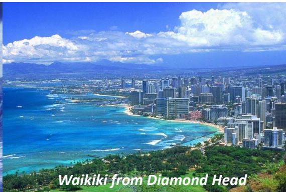
Waikiki from Diamond Head