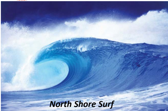
North Shore Surf